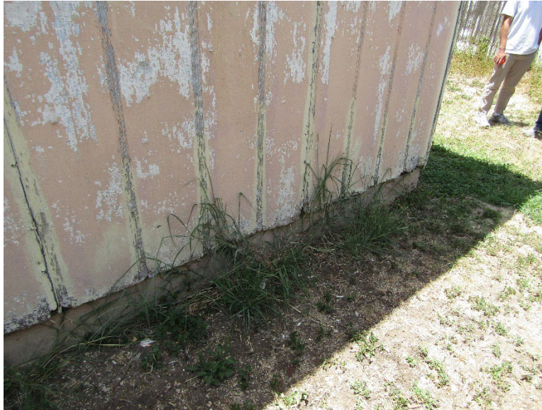
Rear Addition Location