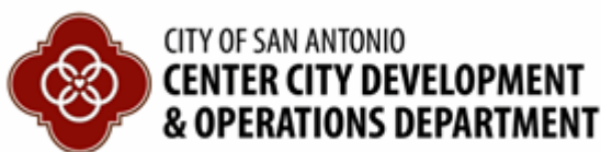
Exhibit D Parking Framework