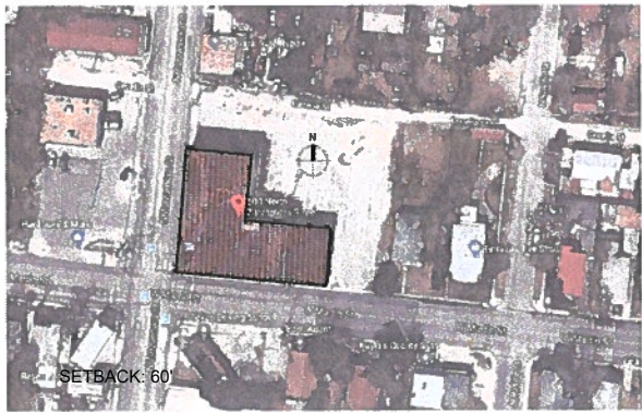
02 PROJECT LOCATION NTS