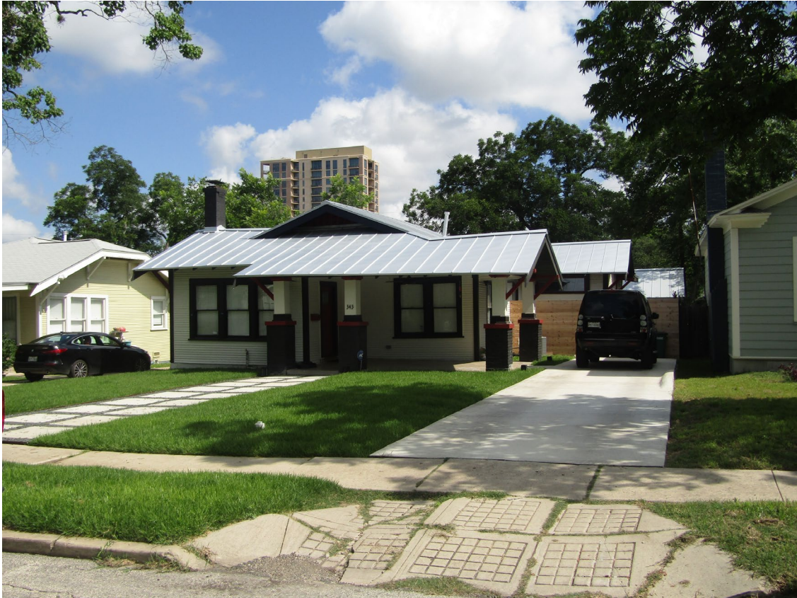
Accessory Structure in the Rear