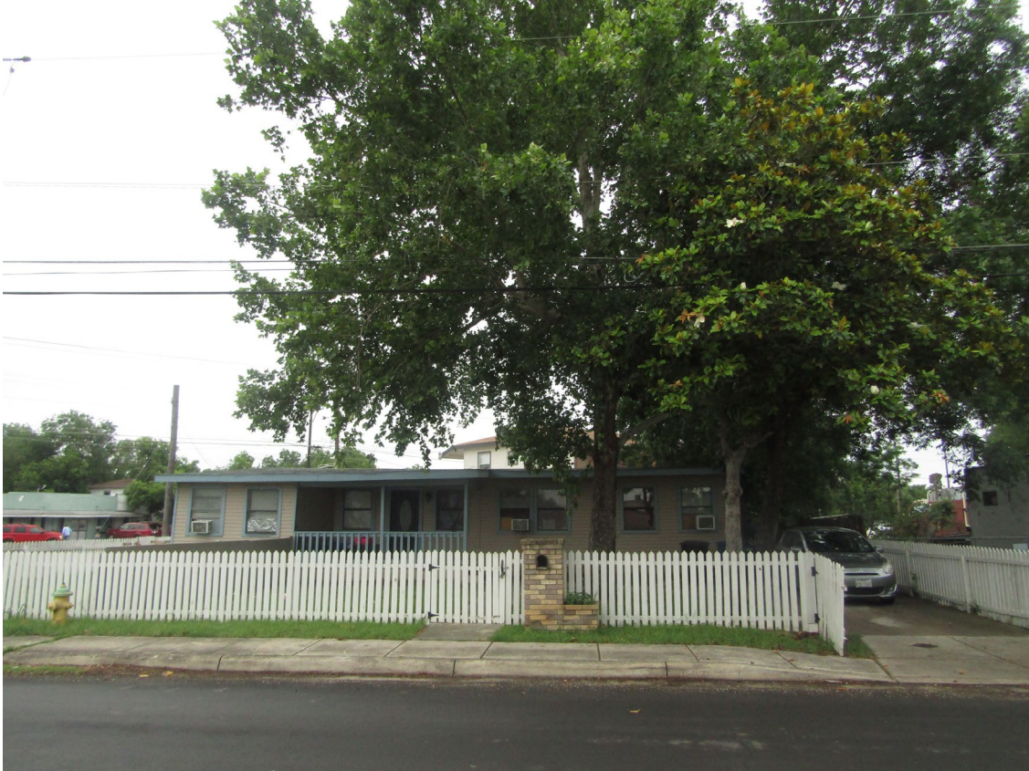
Side of Property