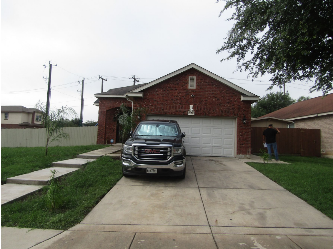
Side of Property