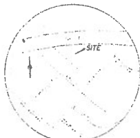
VICINITY MAP SITE SAN ANTONIO, TEXAS

Z-2023-10700036 S Address: 4788 Northwest Loop 410 Legal Description: Lot 3, Block 17, NCB 16069