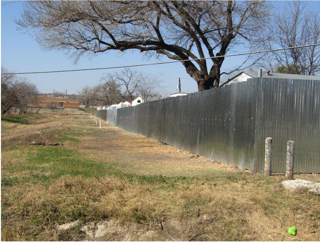
Fence on side of property