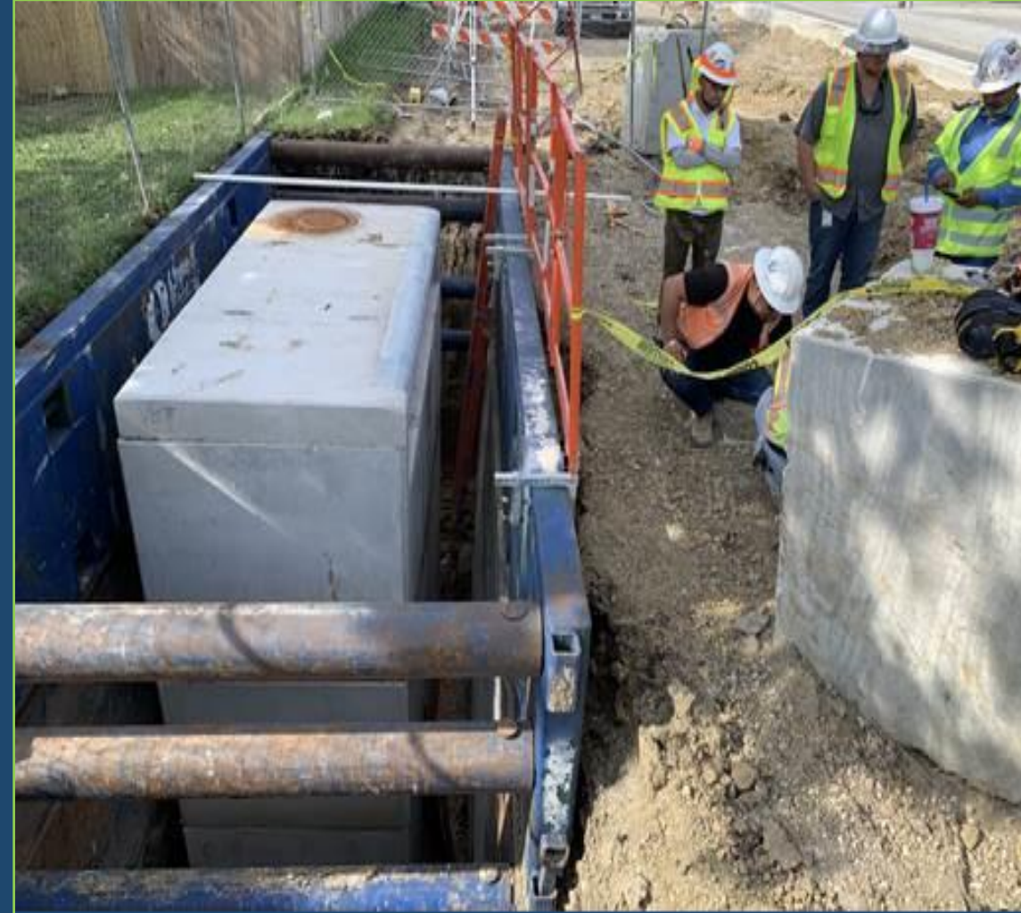
Intersection of Goliad and Cravens