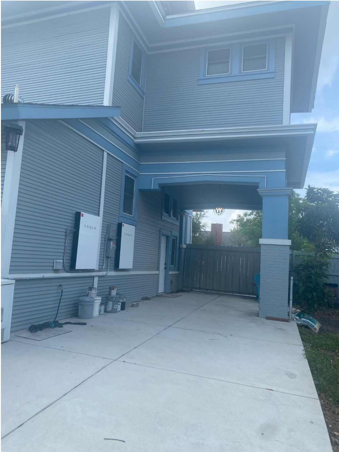
North – Northwest Elevation