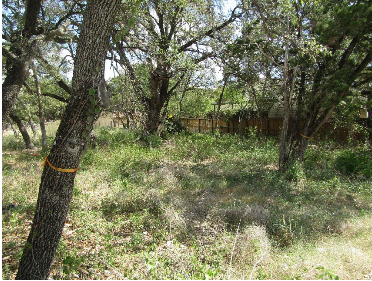
Alternate View of Subject Property