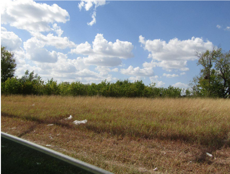
Surrounding Areas from Right of Way