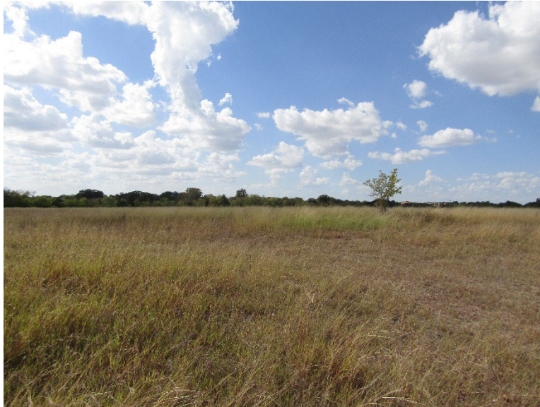
Alternate View of Property