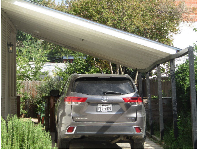
Surrounding Area/Similar Development Setbacks