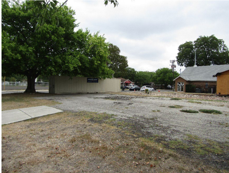
Subject Property Alternate View