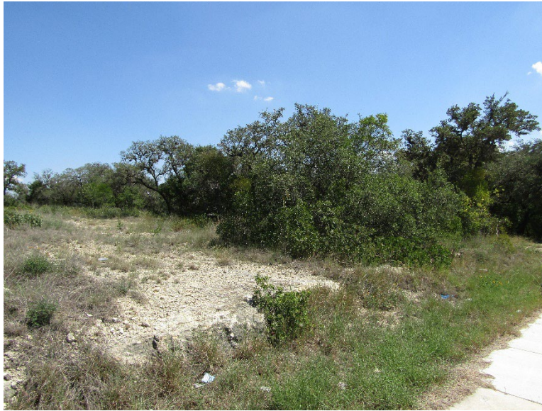
Subject Property/Vacant Lot