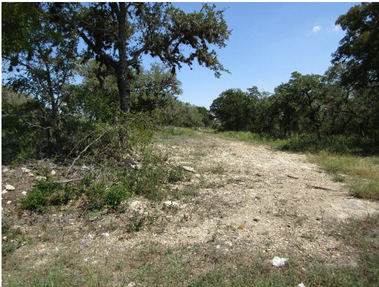
Subject Property/Vacant Lot