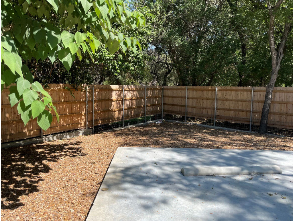
Rear of property (Inside)