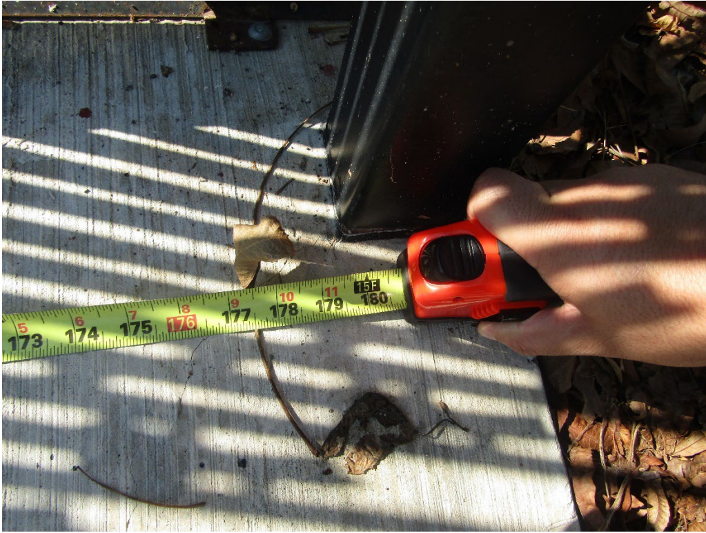
Height of Fence