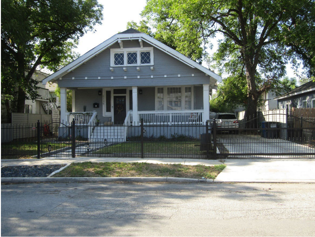
Fence in front of property

Subject Property: 1136 West French Place