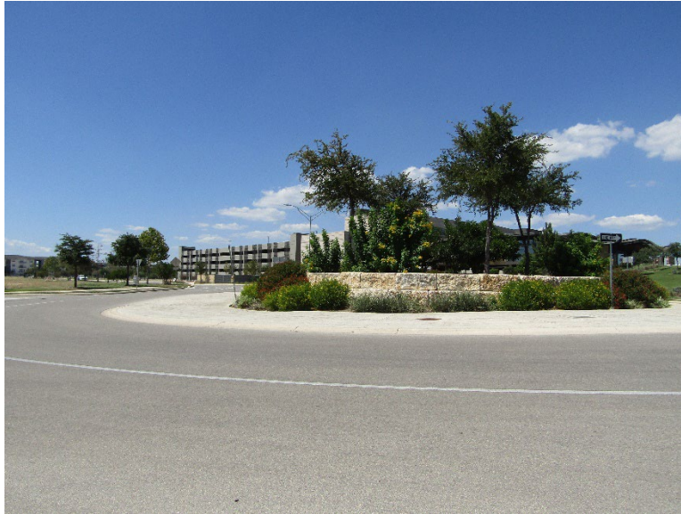
Location of Proposed Fence