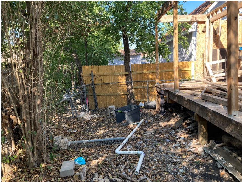
Similar carport found in the area