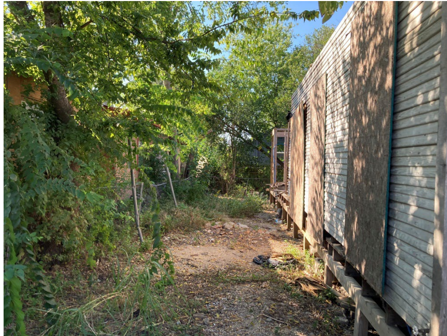
Existing structure side setback