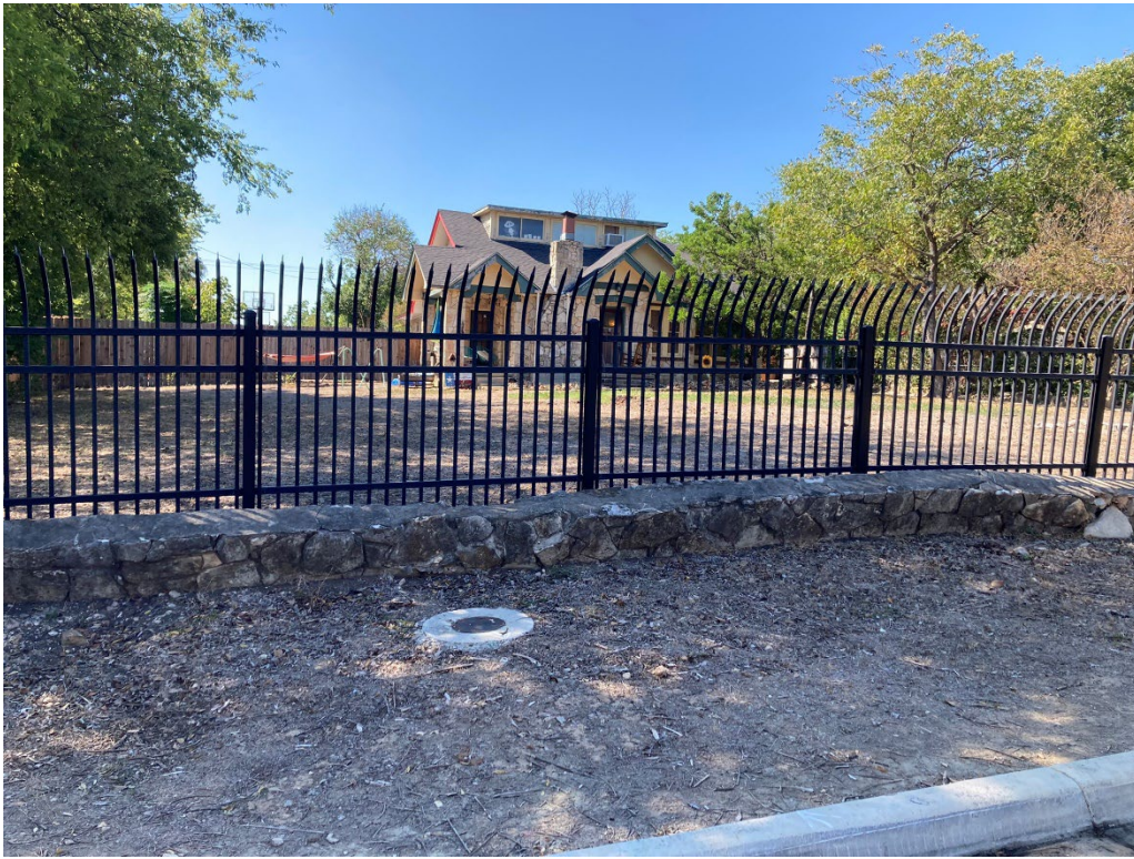
Fence in rear of property