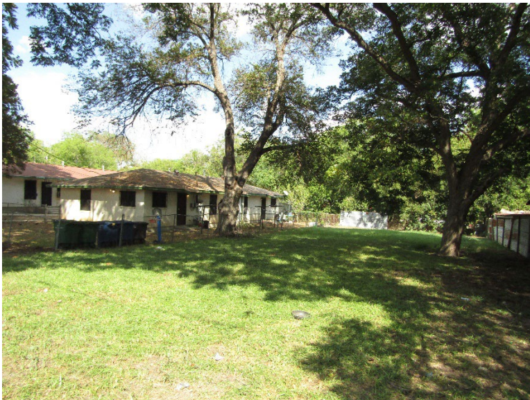
Similar Setback Dwellings to the Right