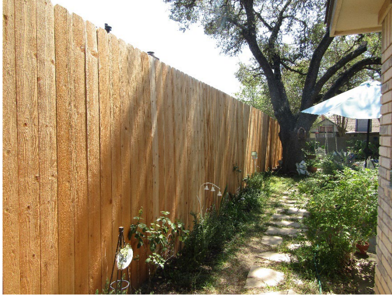
Subject Fence from Neighboring Yard