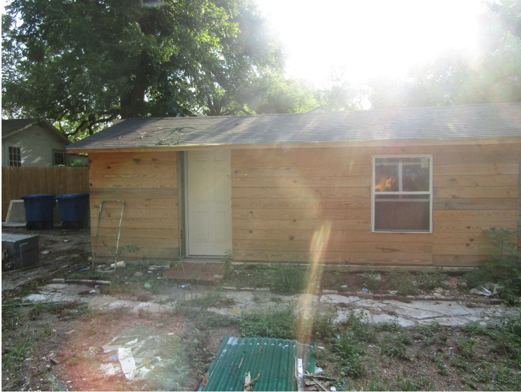
Detached Accessory Structure in Rear of Property