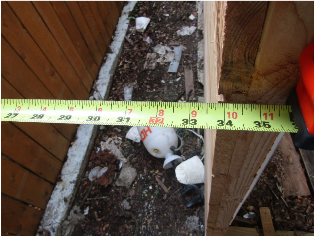
Accessory Structure/Side Setback