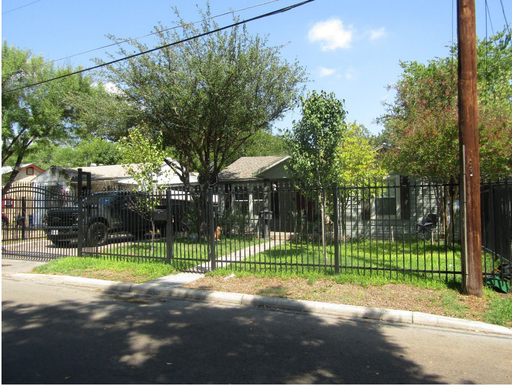
Fence in front of property