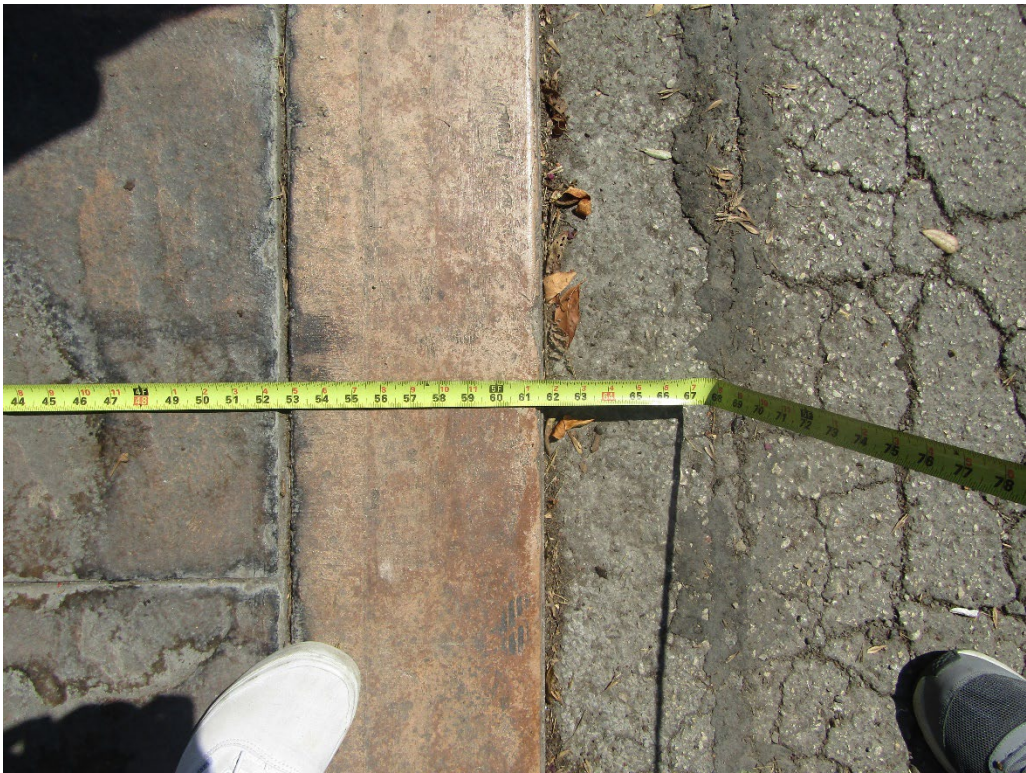
Width of Driveway