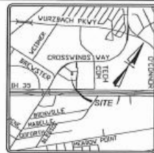
LOCATION MAP NOT-TO-SCALE