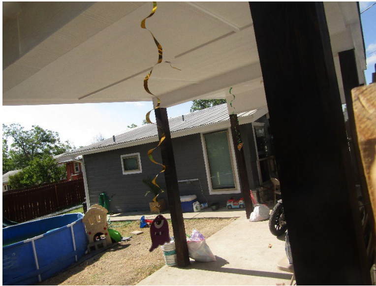
Alleyway View and Measurement