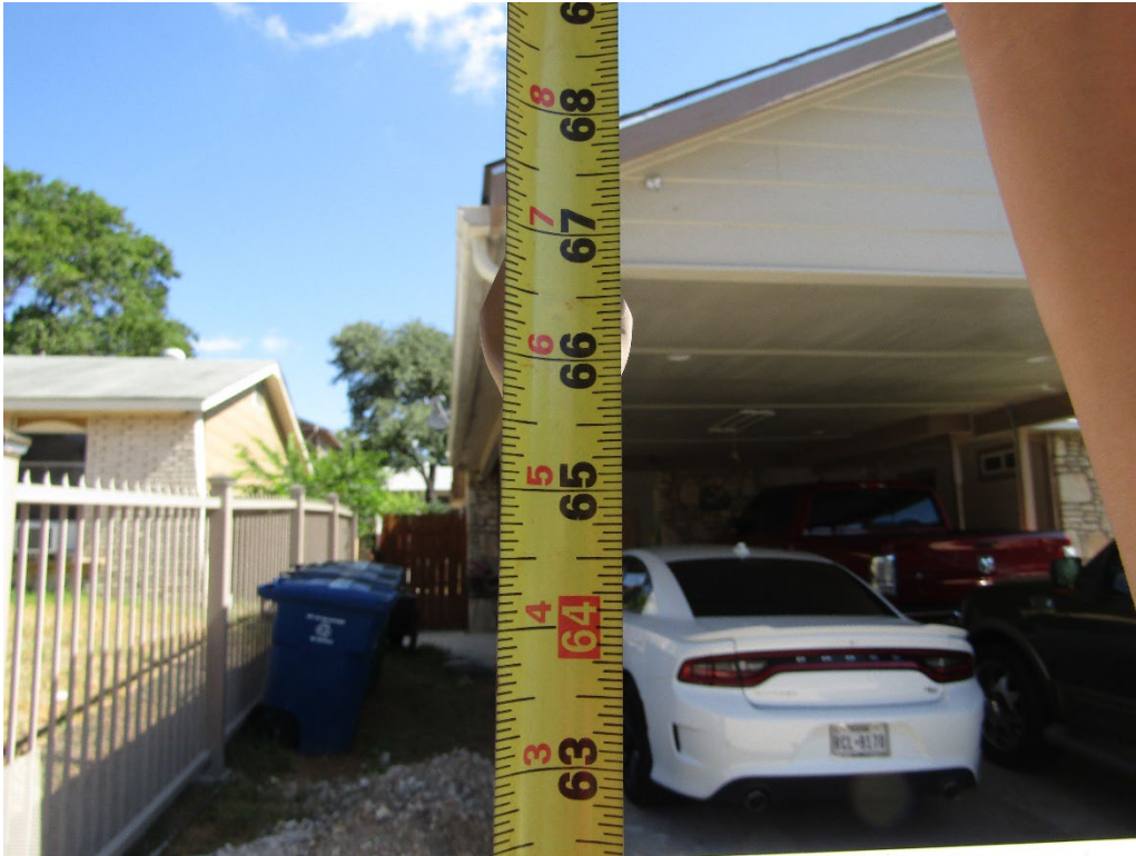
Clear Vision Measurement