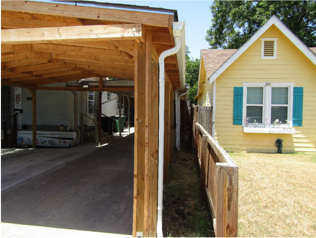
Side Yard Setback