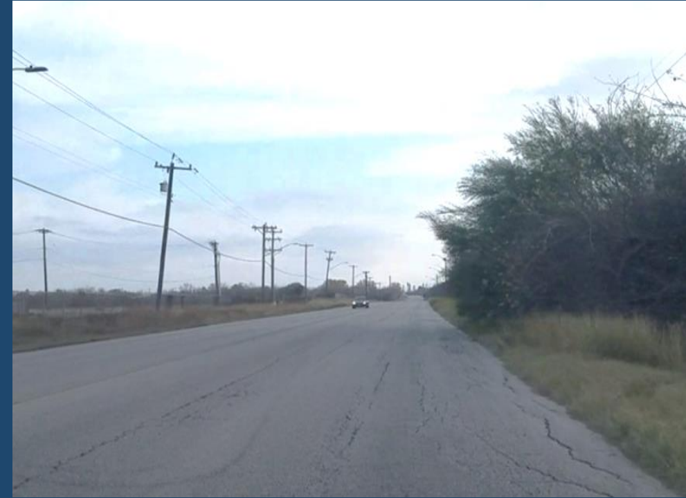
Southbound on S. Presa south of Story Lane