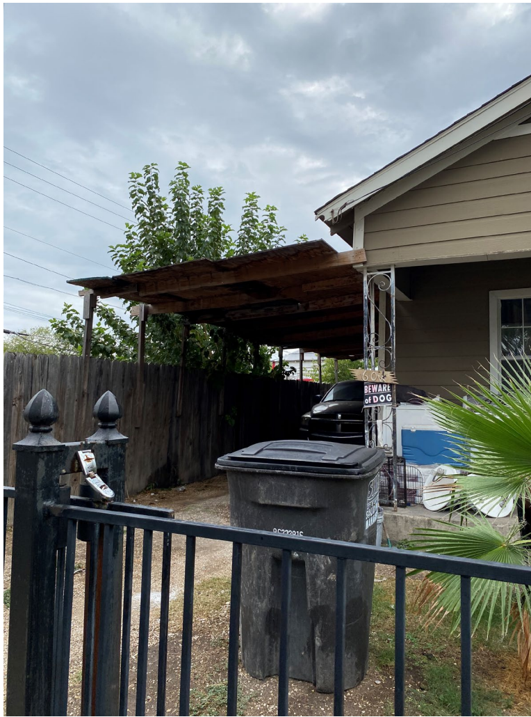
Carport across street