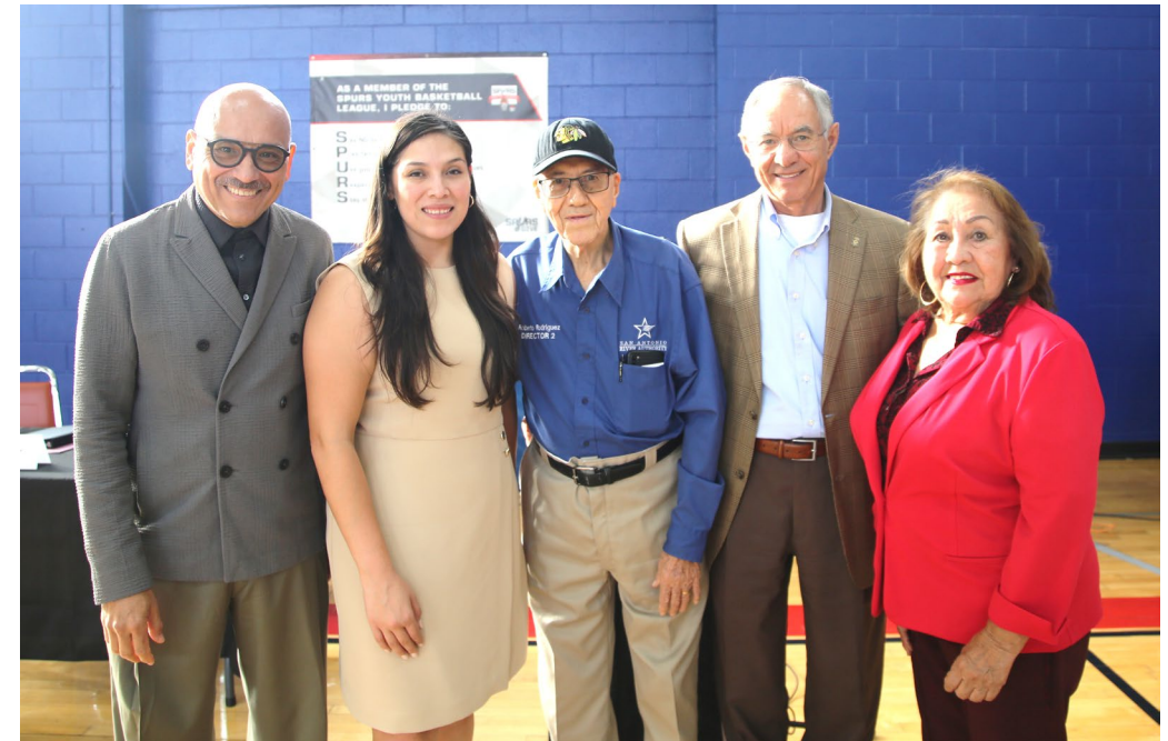
Westside Creeks Oversight Committee