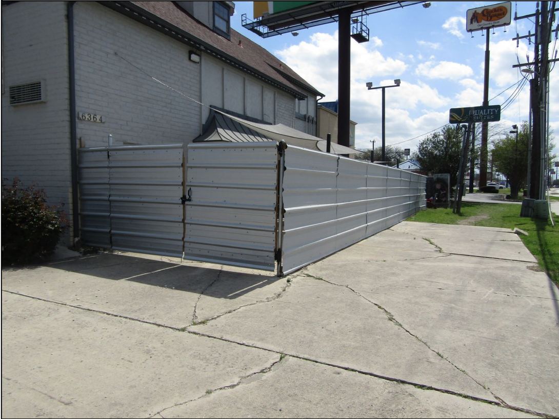
Views of subject property