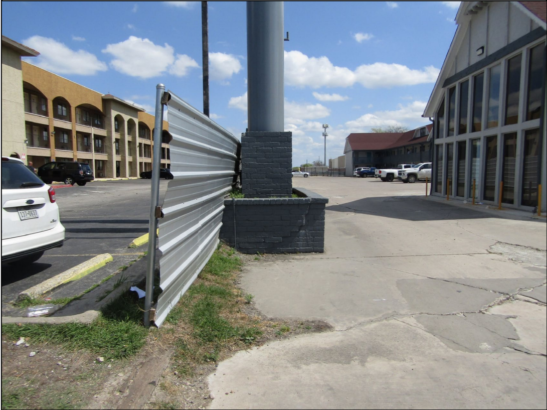
Views of subject property