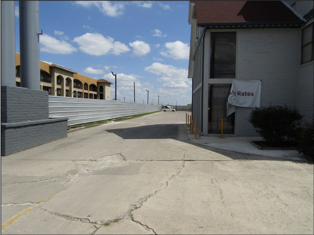
Views of subject property