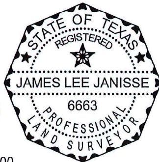
EXHIBIT OF A 35.668 ACRE TRACT

ANTONIO ZAMORA SURVEY NO. 36 ABSTRACT NO. 828 AND JEFFERY B. HILL SURVEY NO. 103 ABSTRACT NO. 308 N.C.B.18225 COUNTY BLOCK 5088, BEXAR COUNTY, TEXAS CITY OF SAN ANTONIO, E.T.J., BEXAR COUNTY, TEXAS CITY OF SAN ANTONIO, BEXAR COUNTY, TEXAS