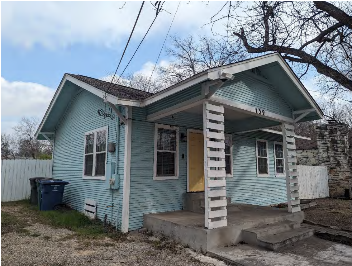
3. 139 Palo Blanco Street – Left side (Southwest oblique)

100 W. HOUSTON ST., SAN ANTONIO, TEXAS 78205