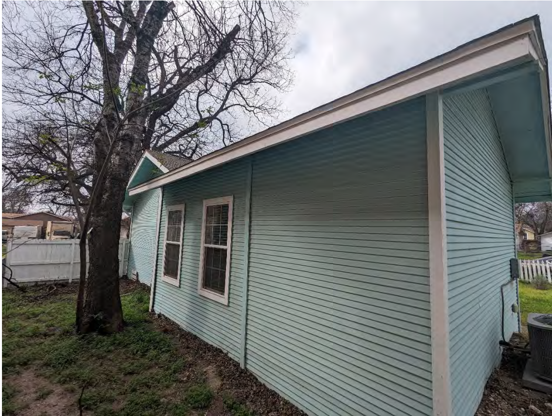
2. 139 Palo Blanco Street – Right side (East)