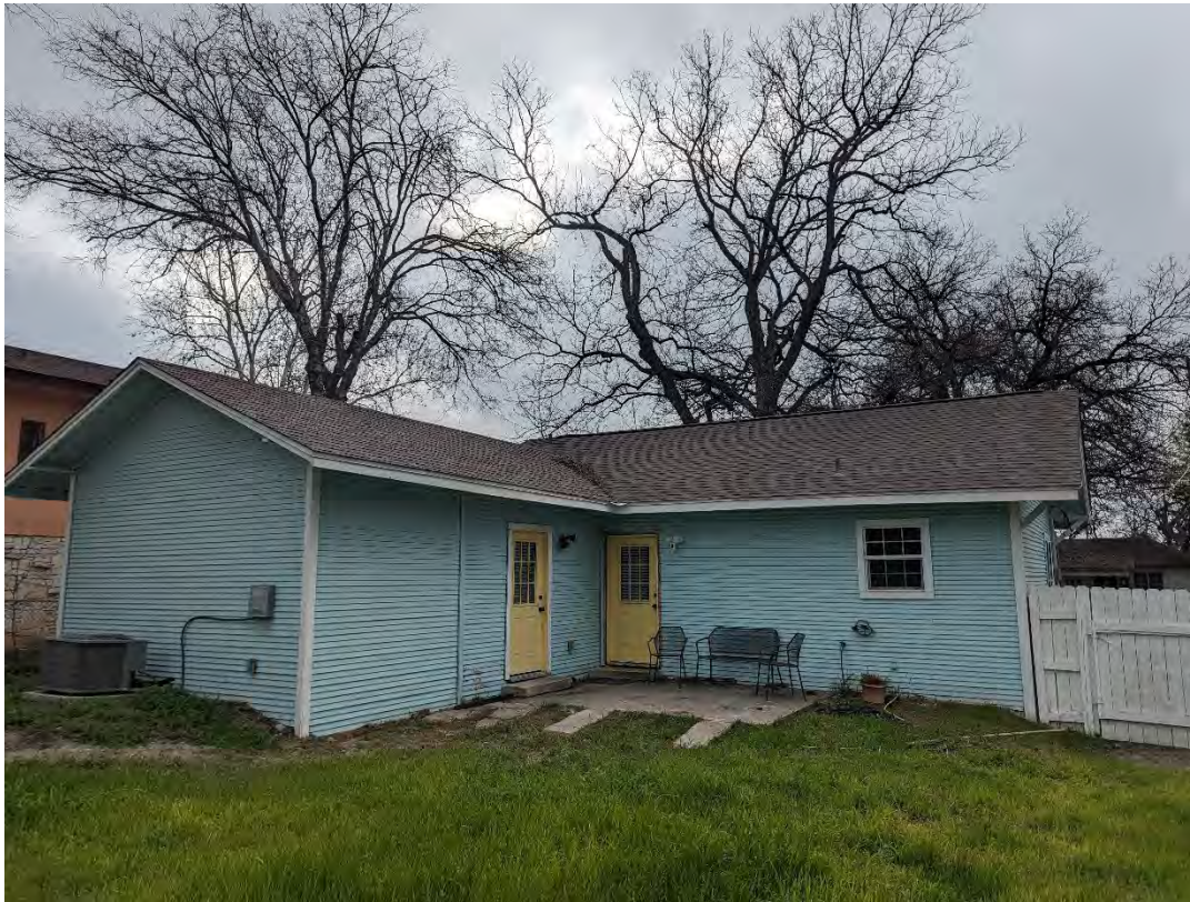
5. 139 Palo Blanco Street (Northwest oblique)