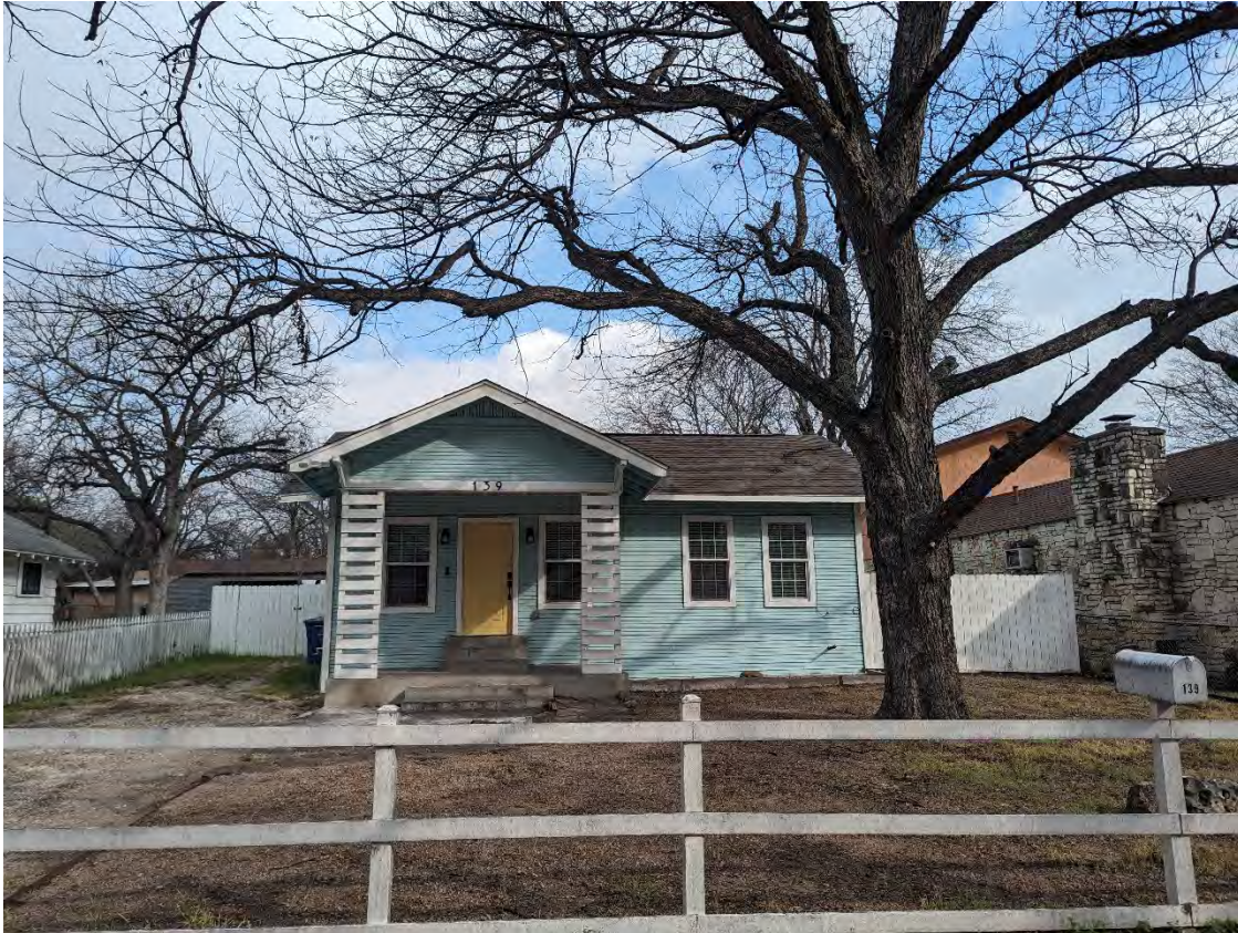
1. 139 Palo Blanco Street – Front façade

100 W. HOUSTON ST., SAN ANTONIO, TEXAS 78205