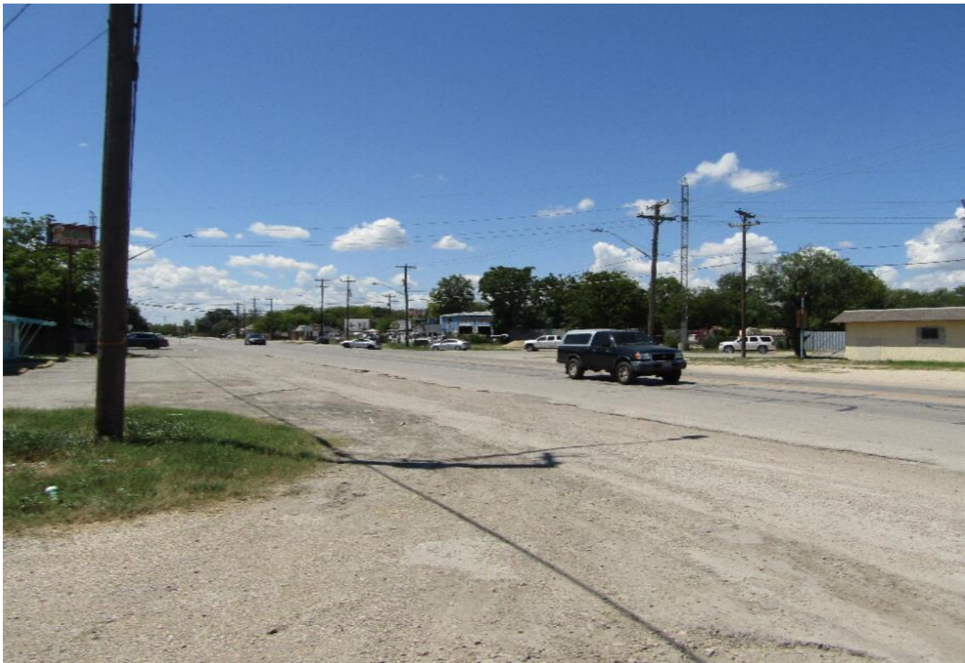
West view of New Laredo Highway