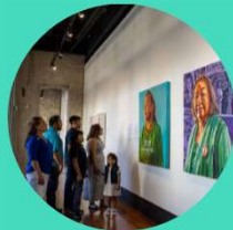
Cultural Events & Exhibits