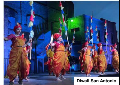
Diwali San Antonio