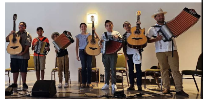
Conjunto Heritage Taller