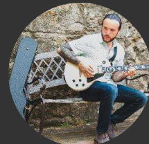
Marketing, Film & Music