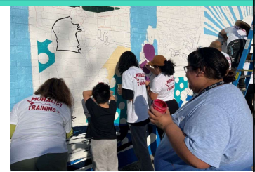
San Anto Cultural Arts