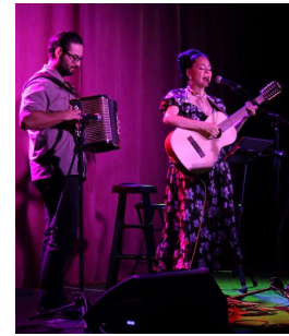
Esperanza Peace & Justice Center