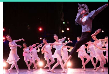
Ballet San Antonio