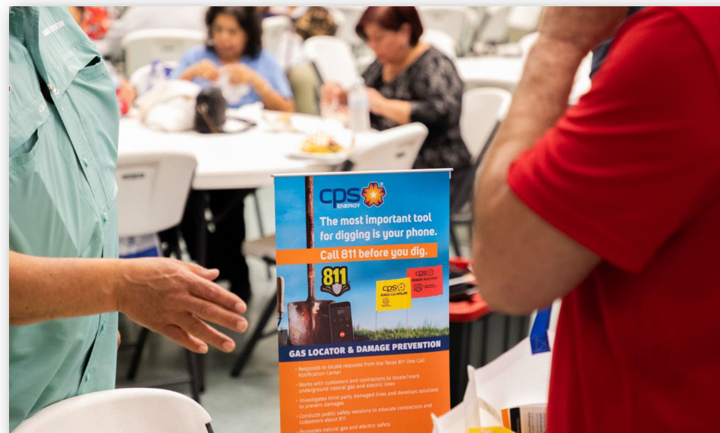
District Community Fair