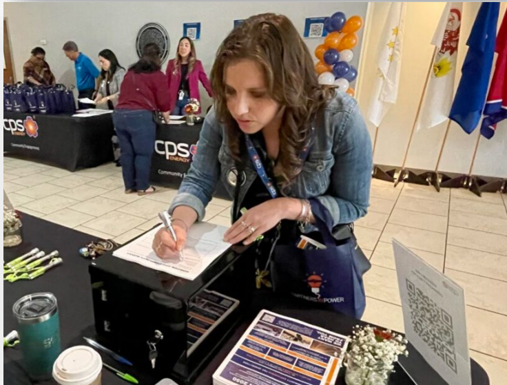
Horizon 2050 community pop-up at Hardberger Park (top) and Partners in Power event (bottom).