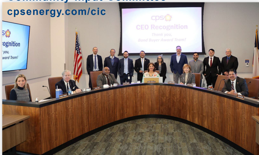
CPS Energy Board Meeting