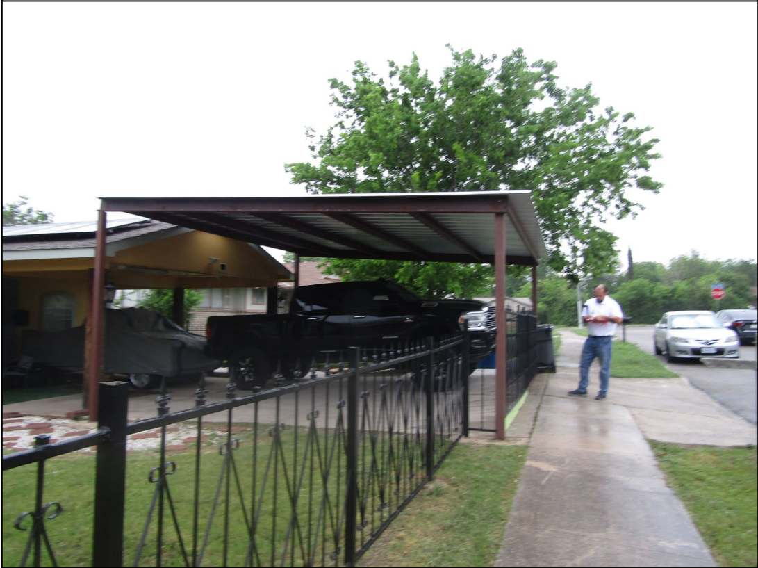
Views of subject property