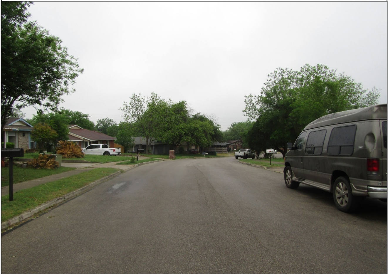
West view from Fairhill Street towards Southwick Street