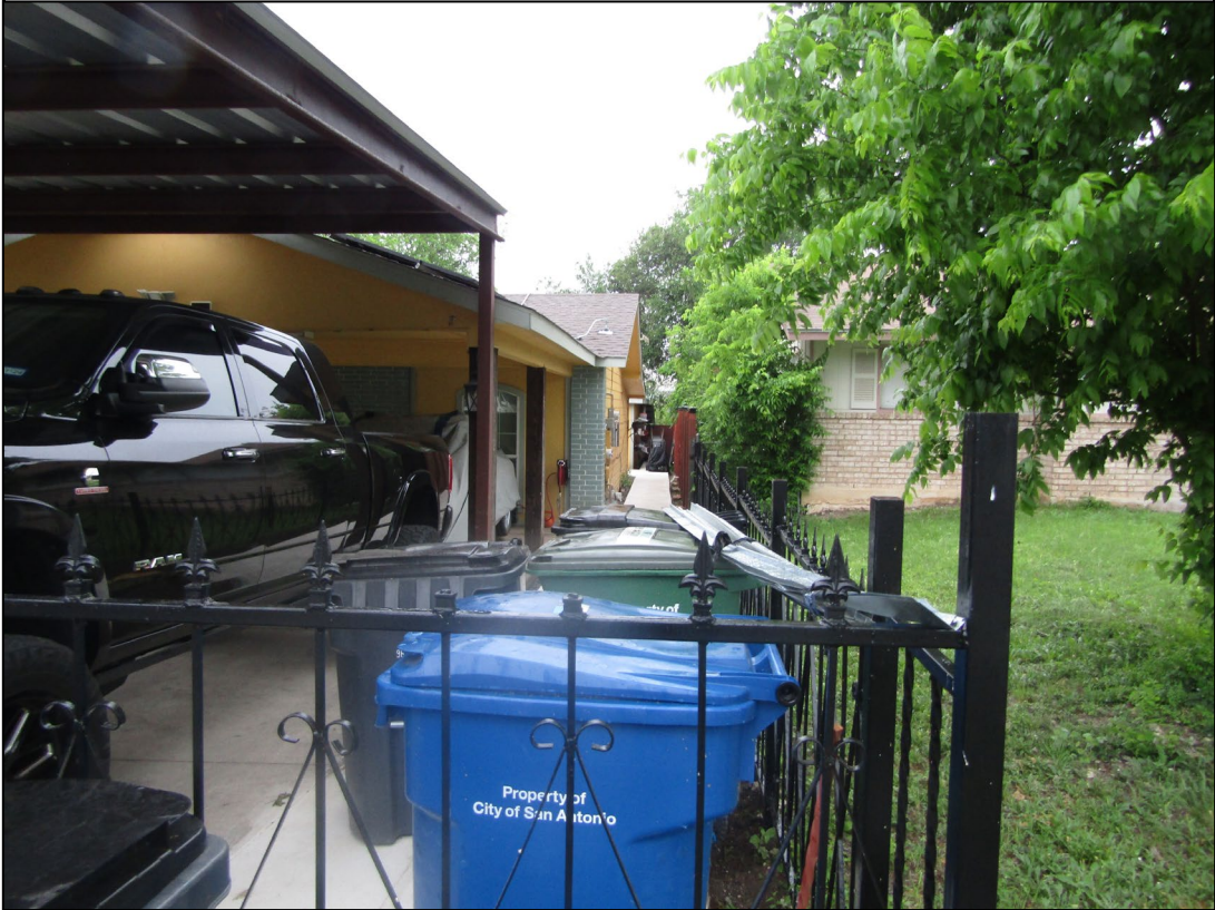
Views of subject property