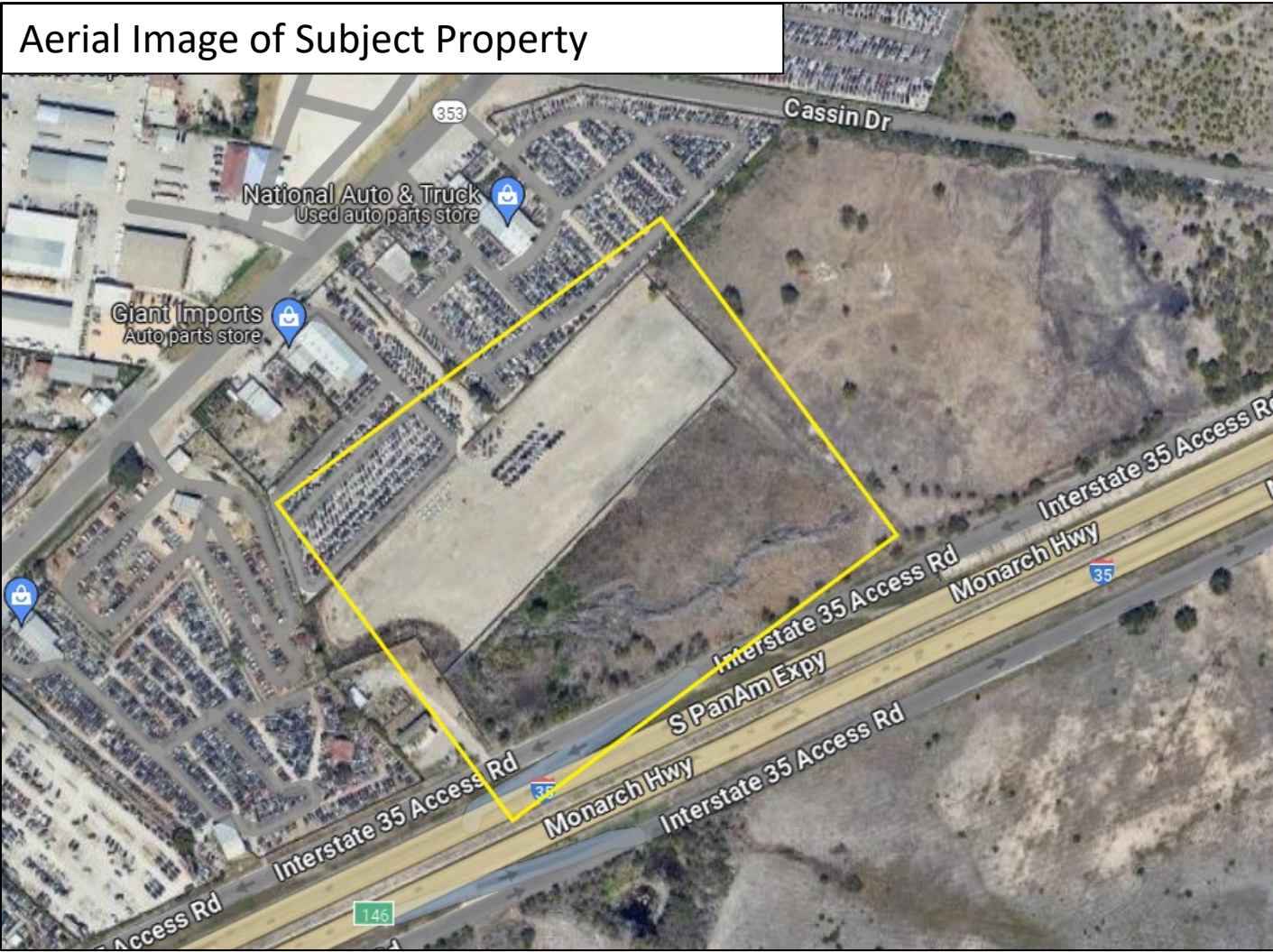
Aerial Image of Subject Property