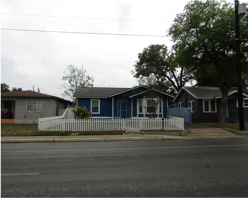
Carport 1" From the Side Property Line (Facing W Malone)