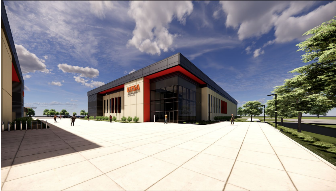
EXHIBIT B PLANS