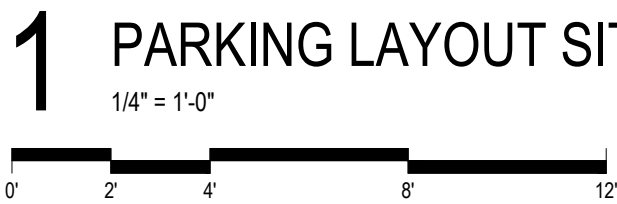
1 PARKING LAYOUT SITE PLAN