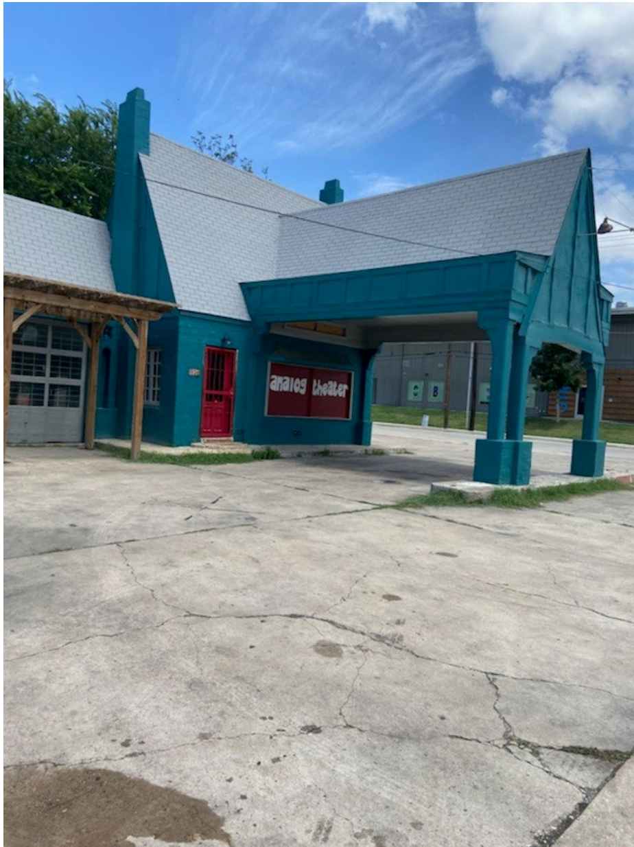
3. 901 Nogalitos Street – Left side (Southwest oblique)