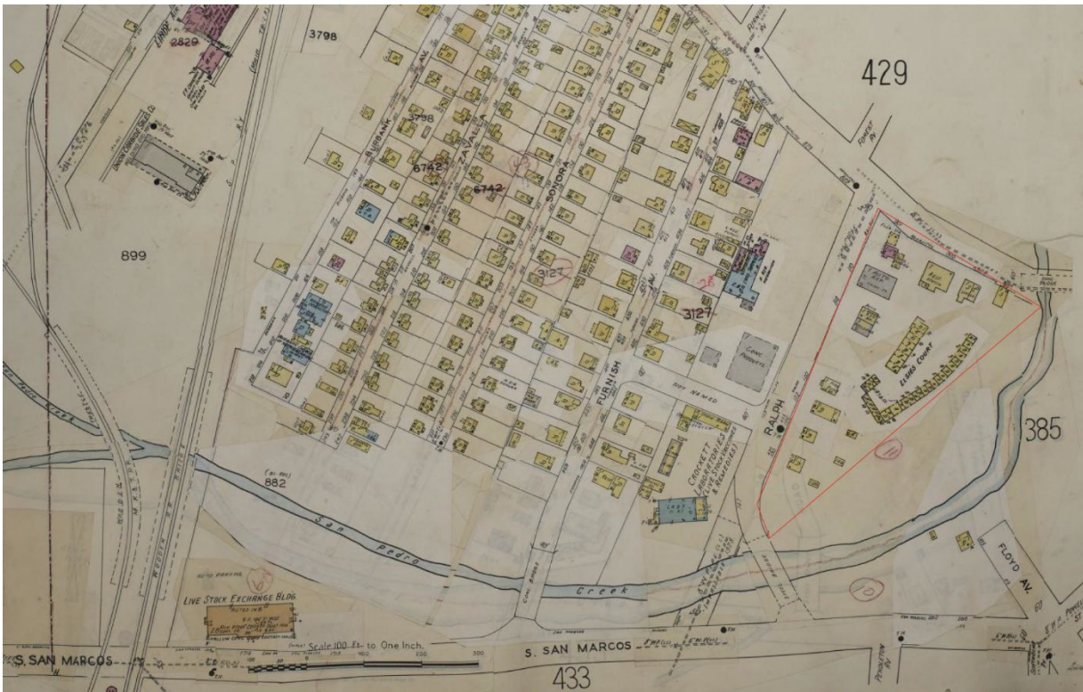
7. Sanborn Map (1951), Vol.4, Sheet 431

100 W. HOUSTON ST., SAN ANTONIO, TEXAS 78205