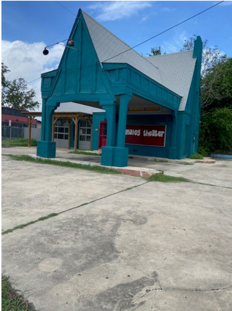
1. 901 Nogalitos Street – Front façade