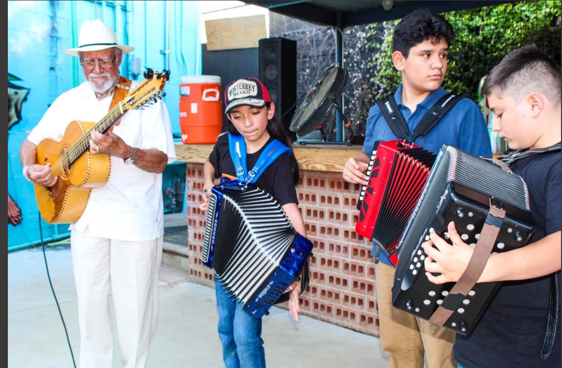
Conjunto Heritage Taller