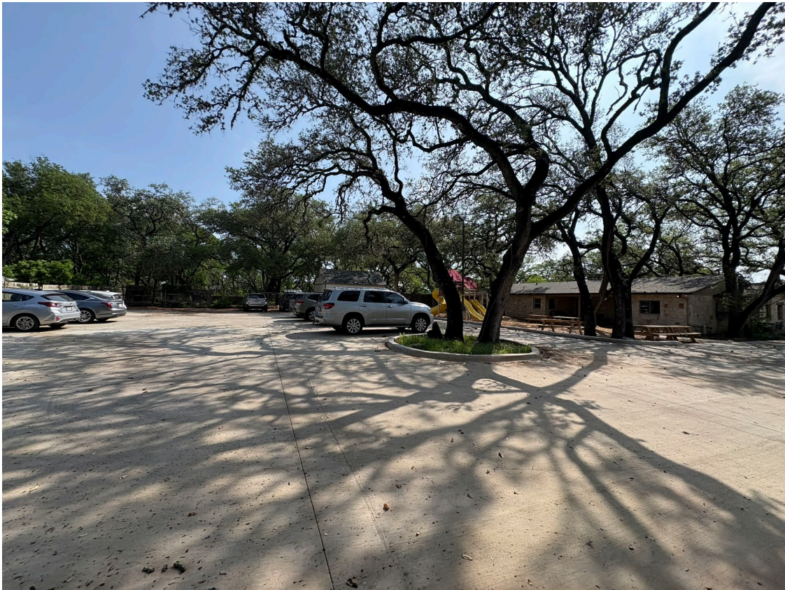
Surrounding Area - Northeast