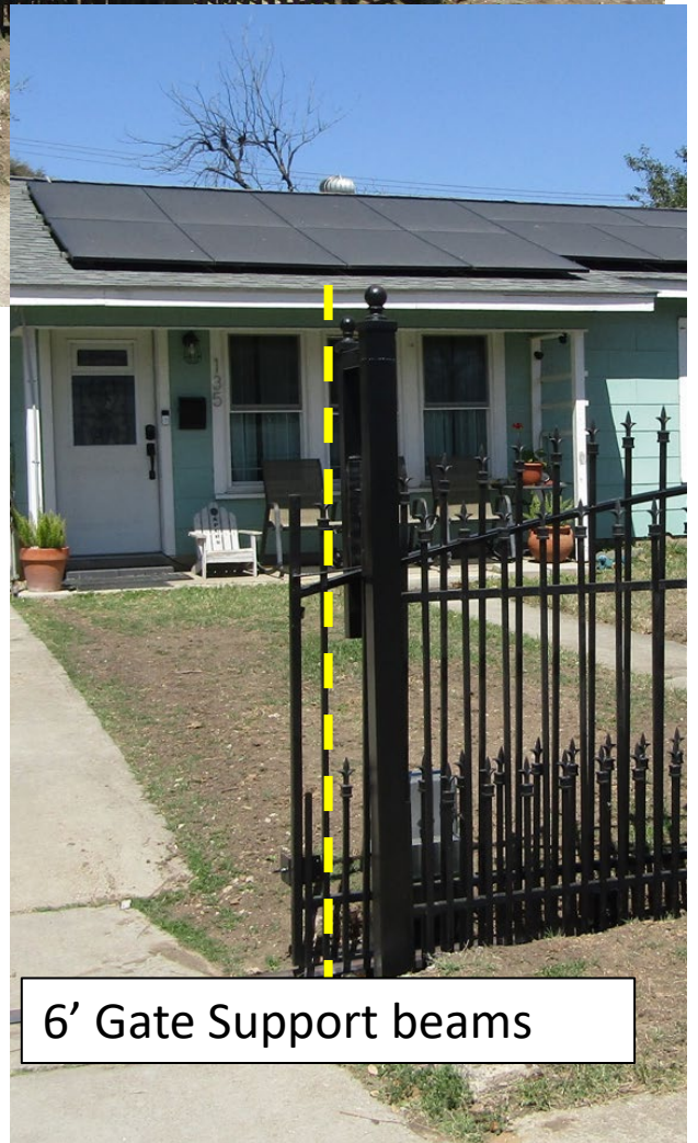
6' Gate Support beams