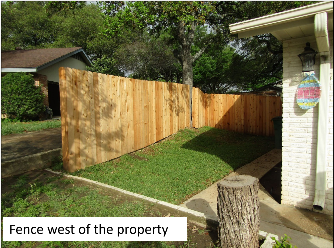
Fence west of the property