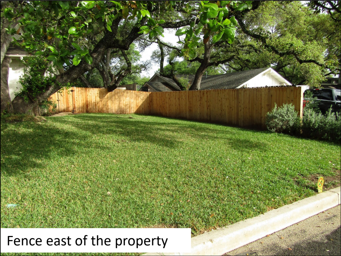
Fence east of the property