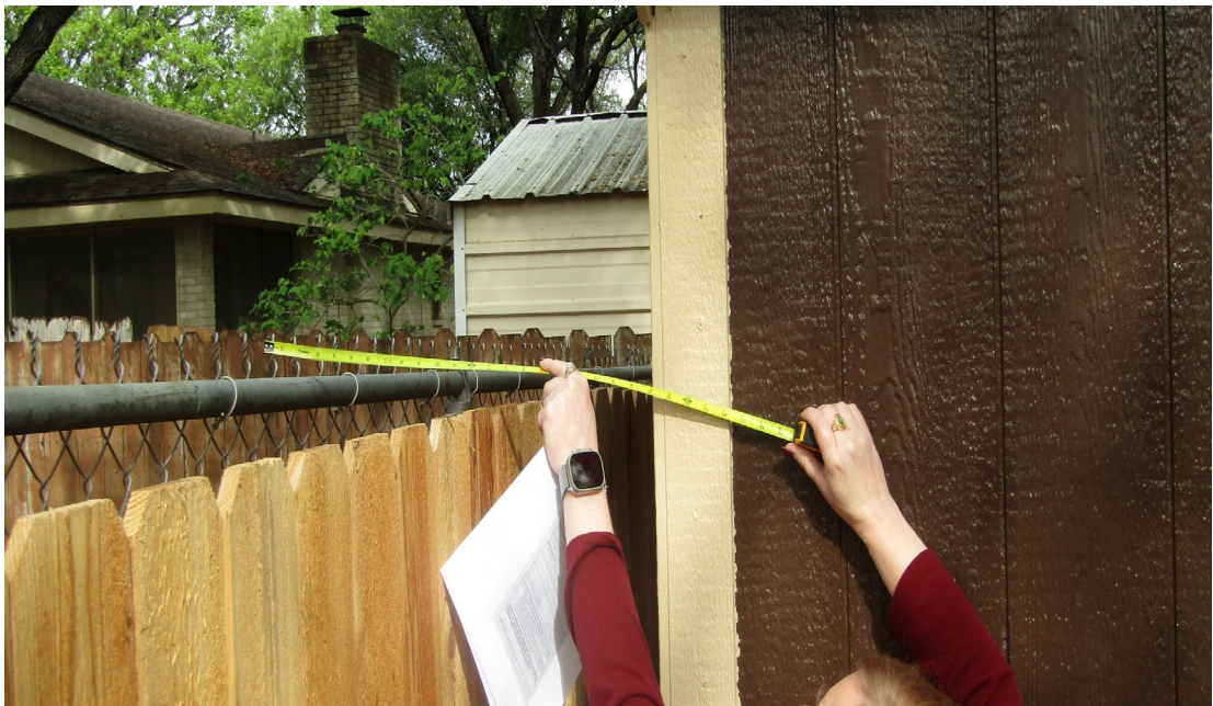
Views of subject property