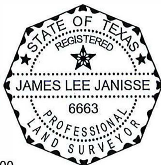
EXHIBIT OF A 16.371 ACRE TRACT