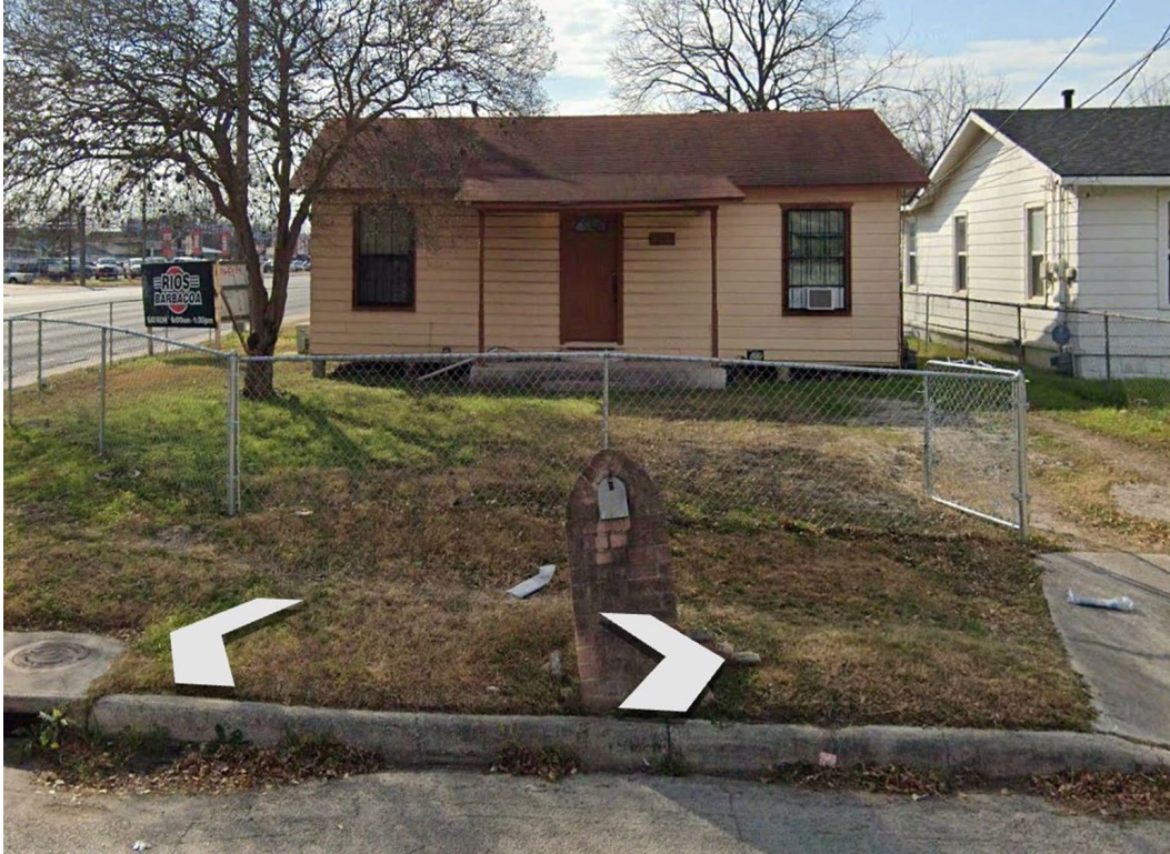
Back view of subject property