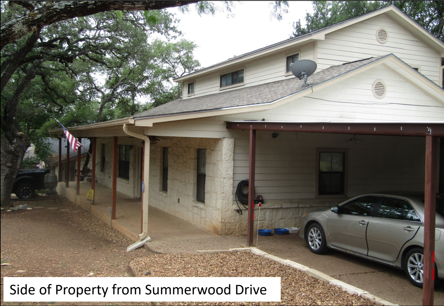
Side of Property from Summerwood Drive