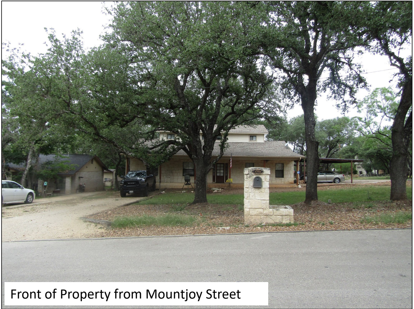
Front of Property from Mountjoy Street