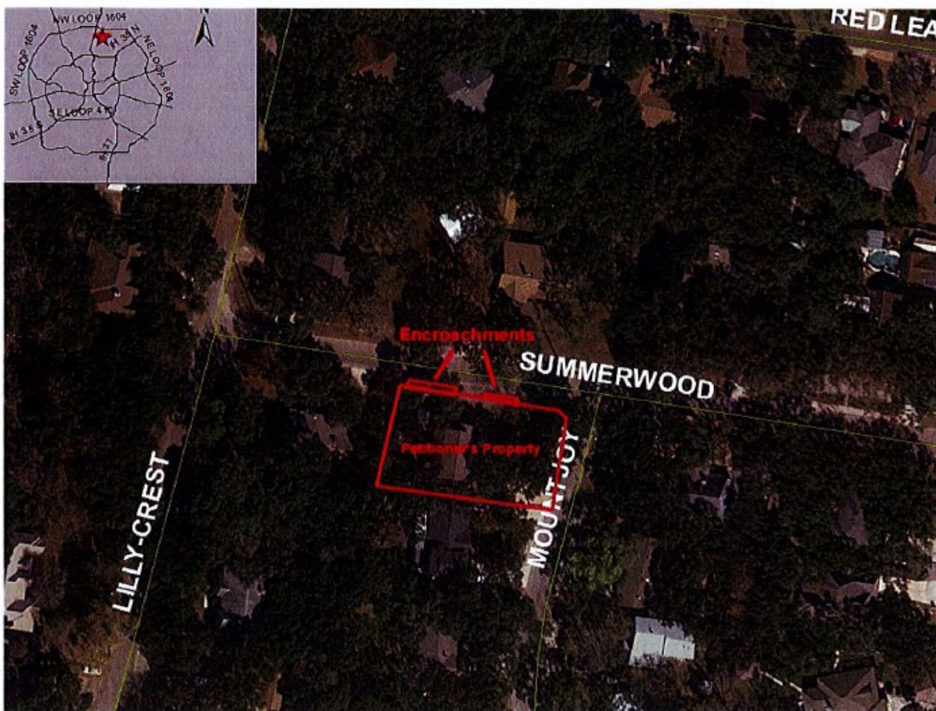
Map of Subject Property